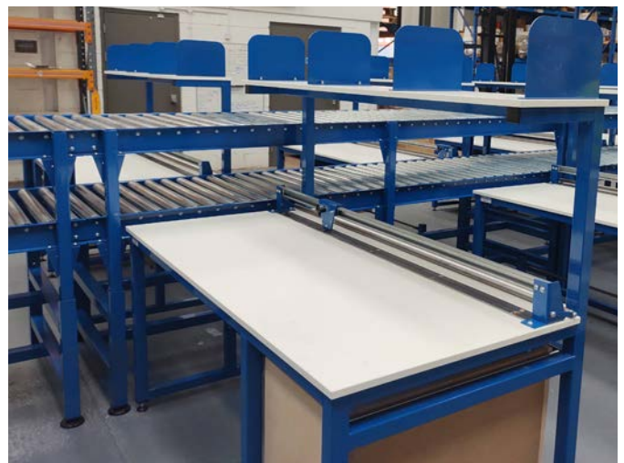
Packing station with packaging cutter & pull-out bin