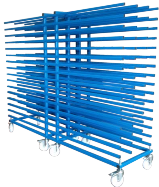
Drying Rack Trolley