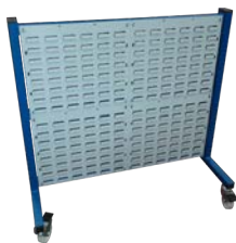
Louvre Panel Trolley