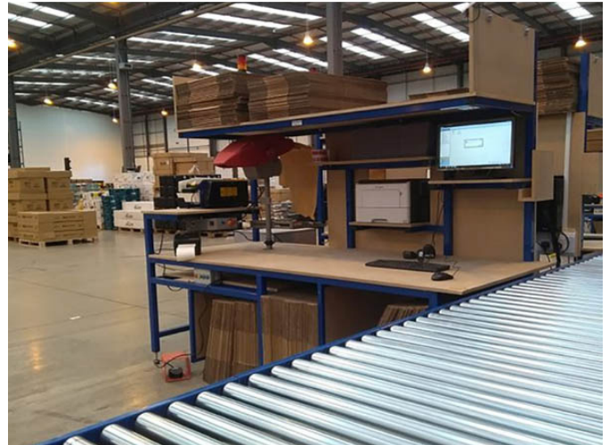
Warehouse packing station with box storage