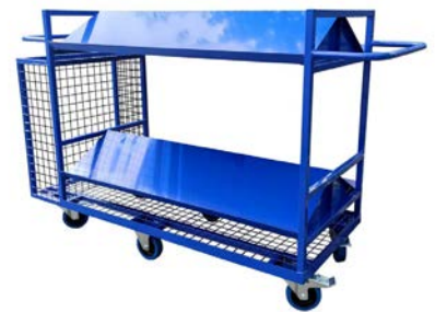
Bespoke Warehouse Trolley