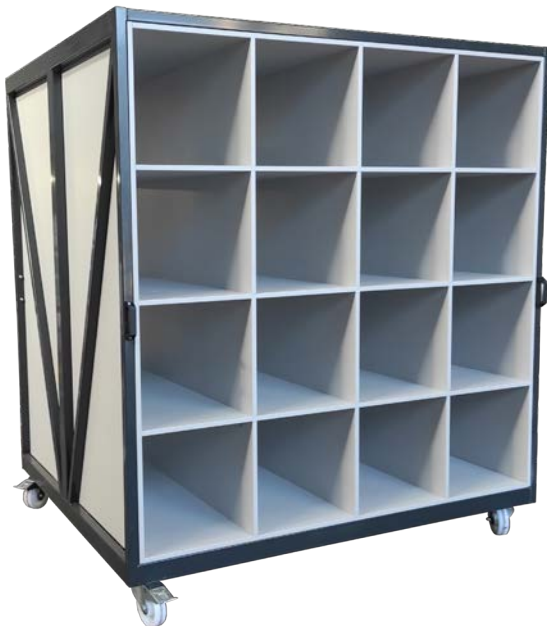
Pigeonhole Storage Trolley

Similarly we can also create factory or warehouse layout drawings for larger projects.