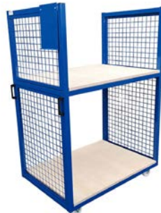
2-Sided Cage Trolley with Shelf