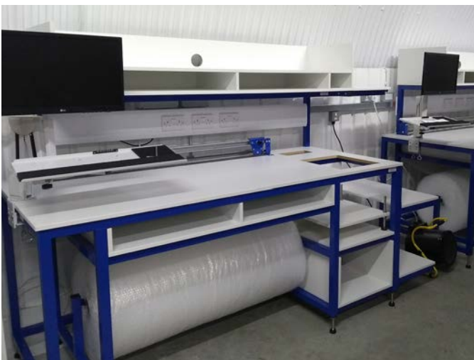
Packing bench with bubble wrap roll holder