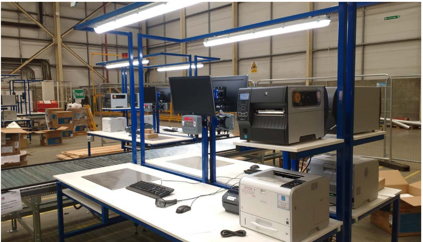
Packing station with built-in scales, printer shelves, and a lighting rail to improve visibility