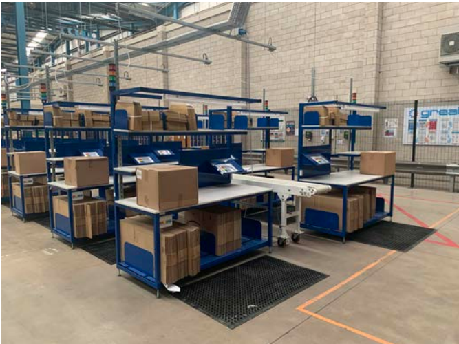
Packing stations for distribution centre

To see further examples of packing stations and project case studies please visit our website or contact our helpful sales team with some details about your requirements.